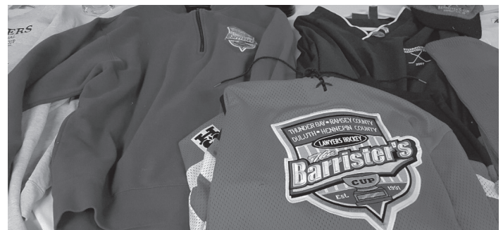
Gifts given at the tournaments.