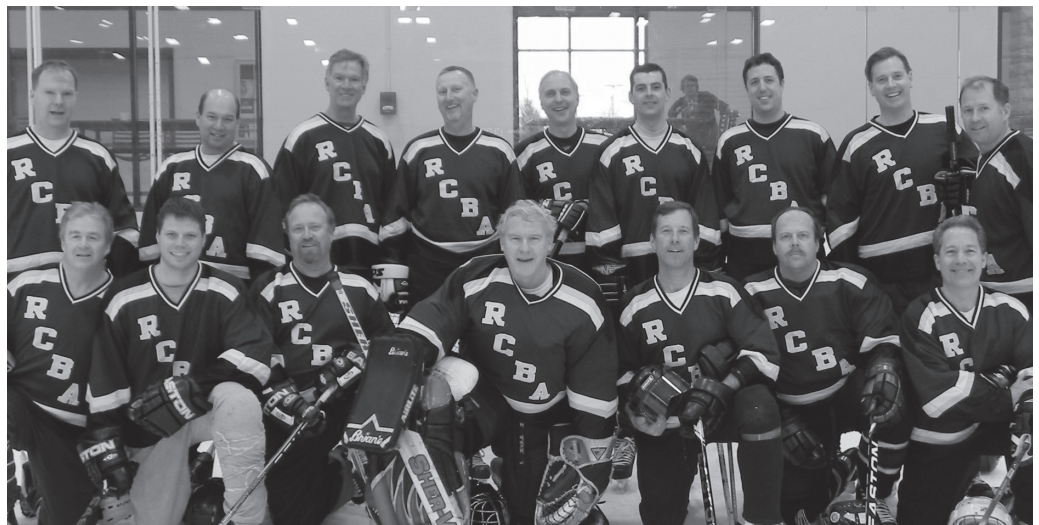
The 2011 RCBA Hockey Team

24-hour crisis assistance at 888-243-5744